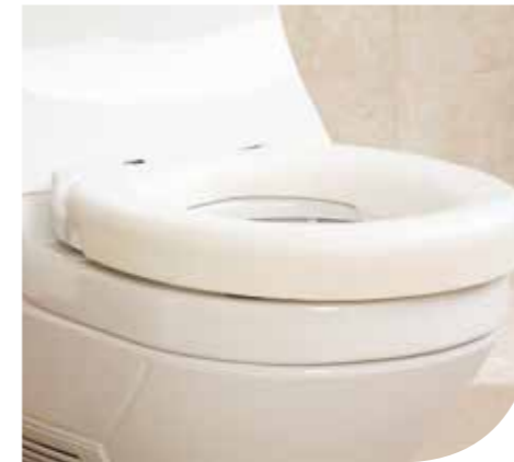
Soft Seat, optional extra