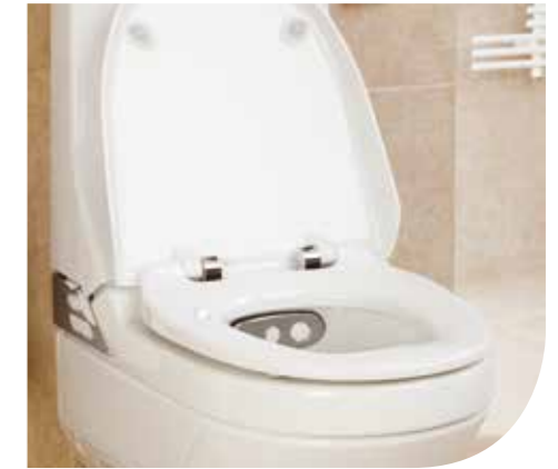
Seat with lid, optional extra