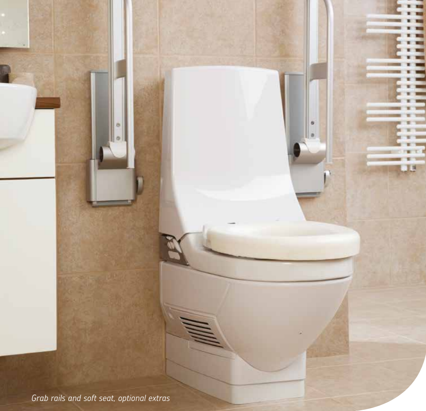
Grab rails and soft seat, optional extras