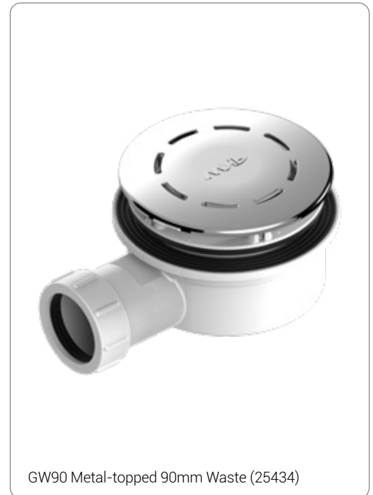
GW90 Metal-topped 90mm Waste (25434)