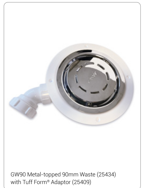
GW90 Metal-topped 90mm Waste (25434) with Tuff Form® Adaptor (25409)