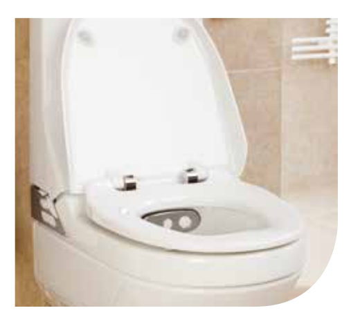
Soft Seat, optional extra