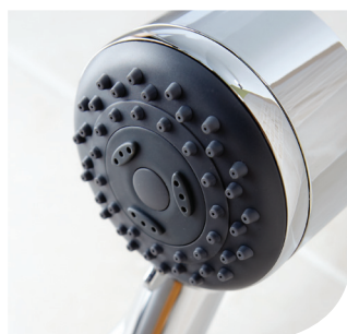
Shower head with 3 adjustable spray patterns