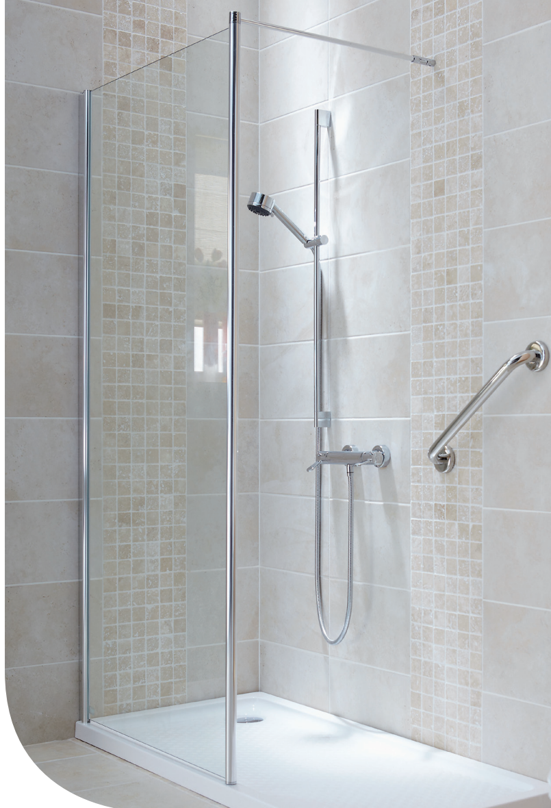
Arka® Thermostatic mixer shower with Level Best® Shower screen, Stainless steel grab rail and Kepple Shower tray