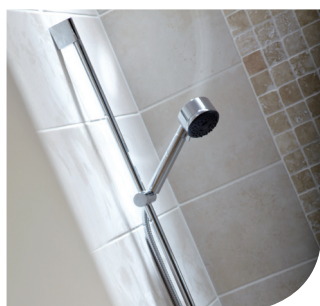
1 metre chrome riser rail