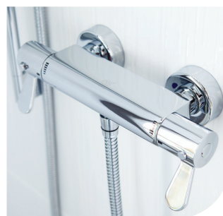
Paddle operating levers