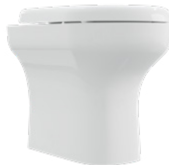
Navlin Back-to-Wall Toilet Pan with Carbamide Seat